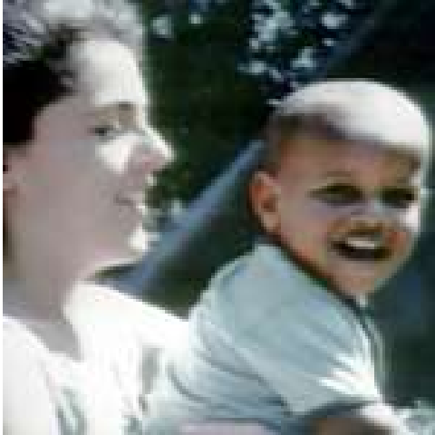
Young Barack and his mother