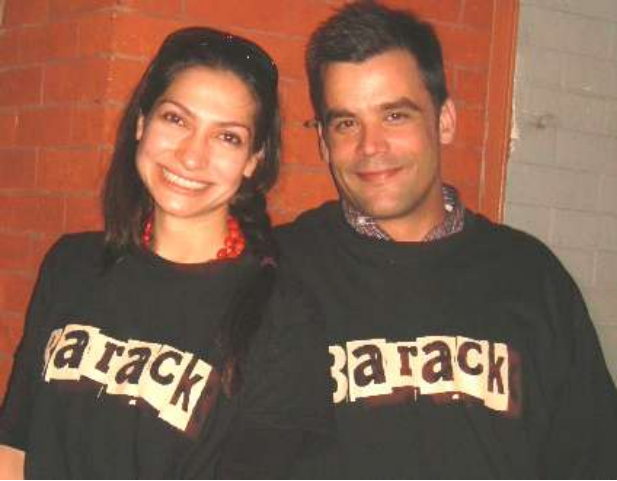
Recent Columbia University graduates